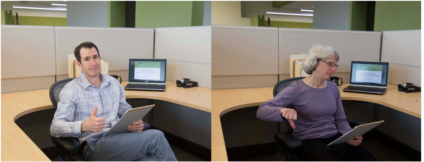
Occupant feedback during task tuning allows for energy savings while maintaining occupant comfort.