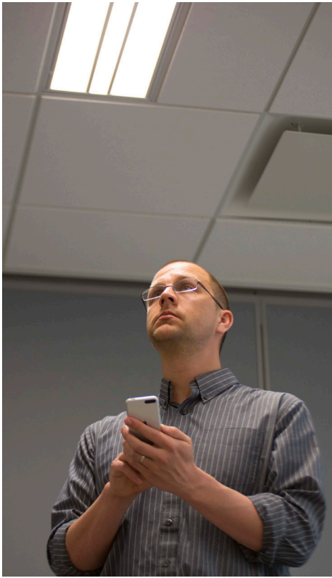
Adjusting light levels using handheld device.