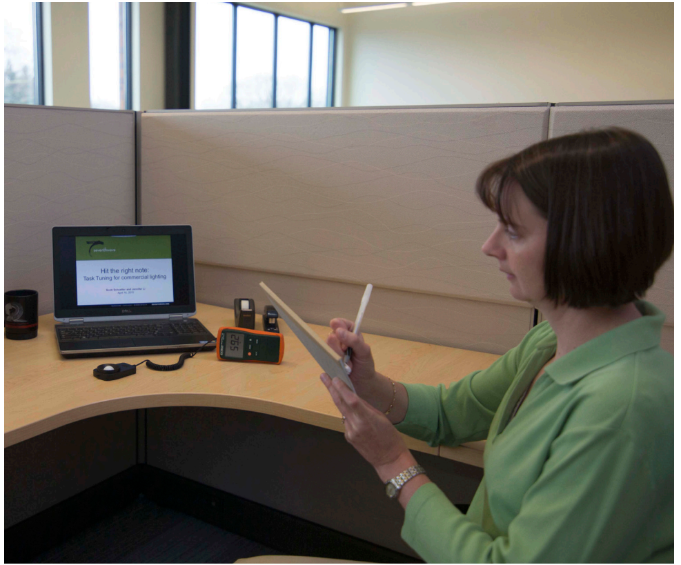
Measuring light levels on the working surface.