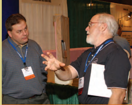
Target: Market Providers